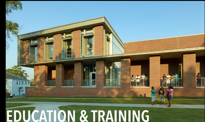
EDUCATION & TRAINING