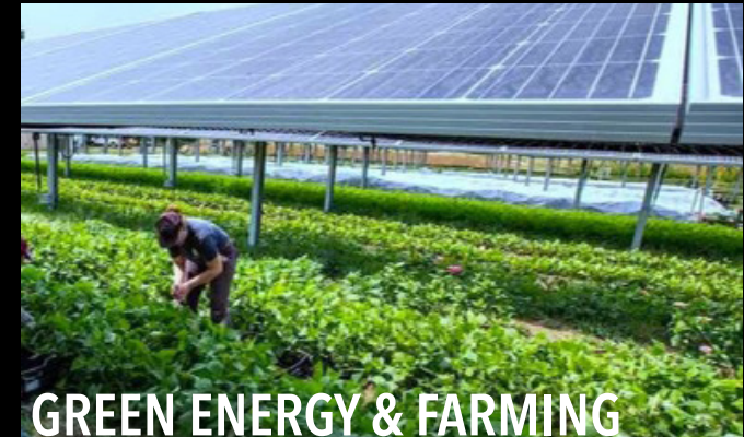
GREEN ENERGY & FARMING