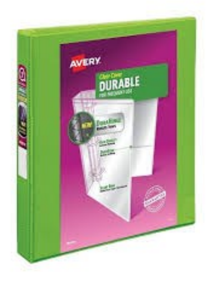
1 INCH BINDER WITH CLEAR FRONT POUCH