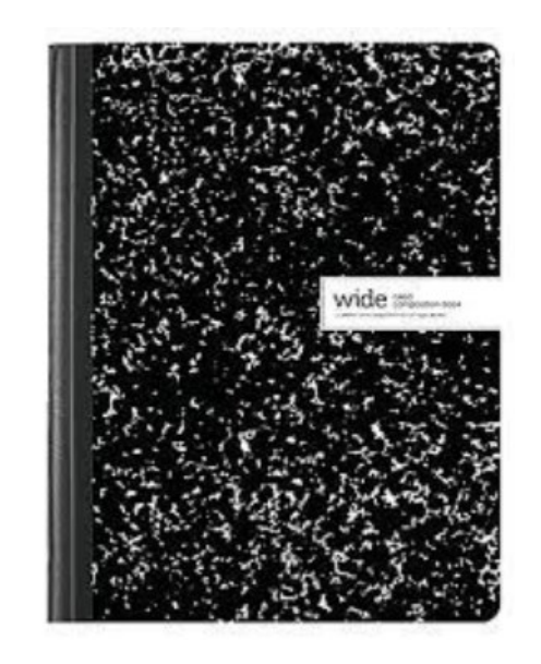
WIDE RULED COMPISITION NOTEBOOK