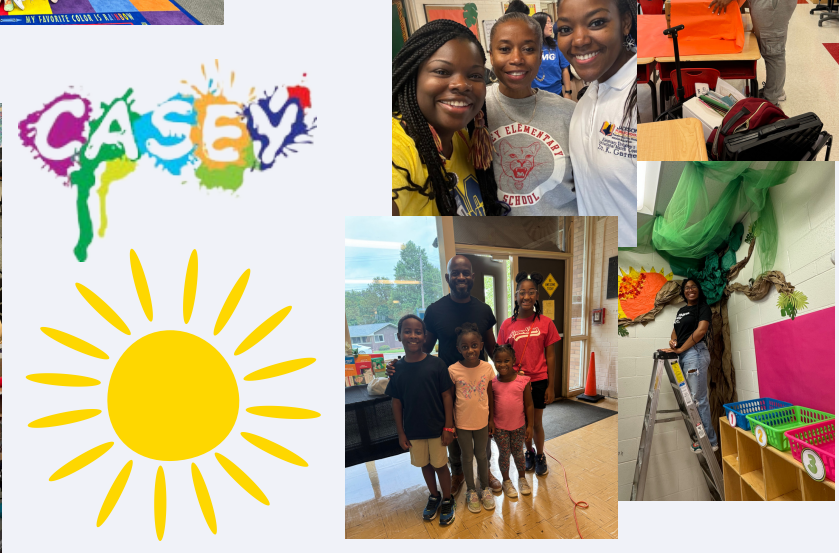
Casey received support from parents, families, district employees, and former students at our annual beautification day.!!! #Strong Start!