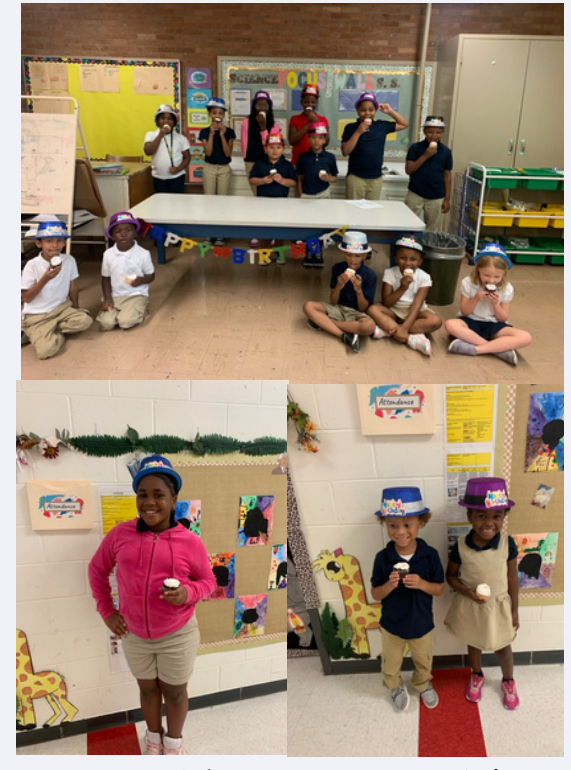
Happy Birthday to our Casey scholars born in the month of August.