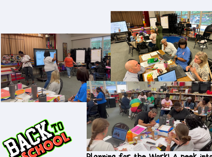
Planning for the Work! A peek into Professional Development at Casey!