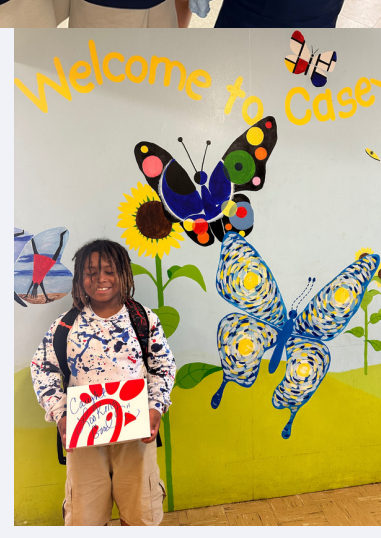
Caught looking good.!!! Scholars were randomly selected and celebrated for their accomplishments with a Chick Fil-A meal